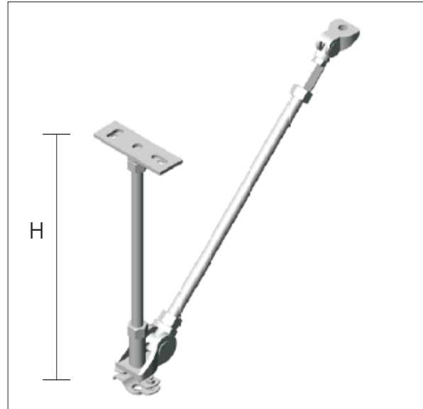
A centre line "dimension H" of 350mm should not be exceeded when using M16 angular braces

Application Stourflex pipe anchors are designed to provide the fixing points necessary when expansion joints are to be installed. The pipe anchor is a readily available alternative to fabricating and welding on site. The anchor can be supplied fully assembled or in kit form. The pipe anchor is suitable for floor, ceiling and wall mounted pipework installations. The JP175 pipe anchor is rated for loads up to 2kN and outside diameters up to 67mm.